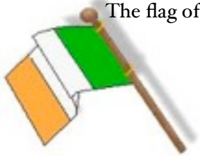
The flag of Ireland

Remember to wear your hat, mittens, coat, boots, and snow pants every day. Don't forget to bring your tennis shoes for physical education class.